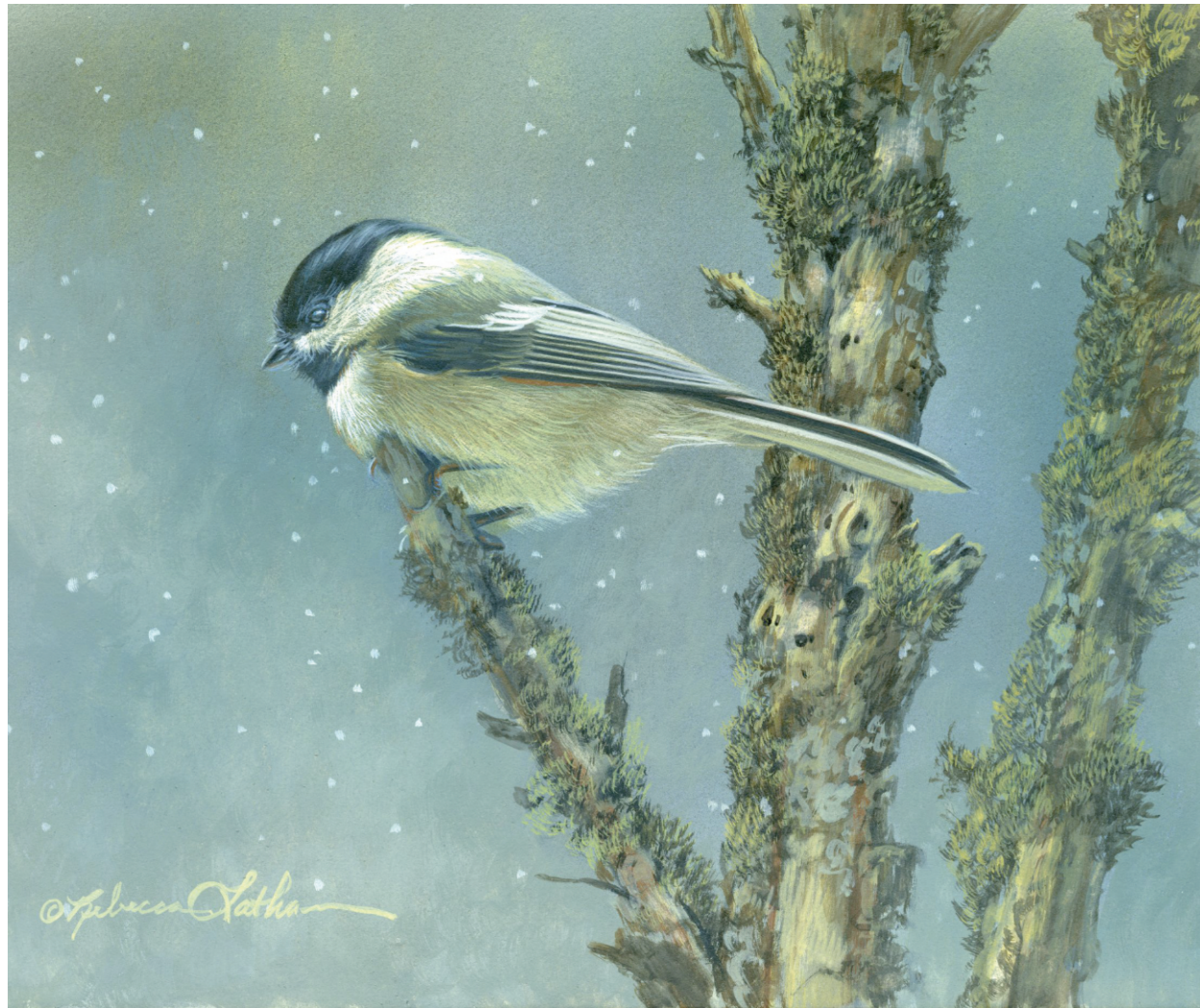
Snowlight Visitor - Blackcapped Chickadee

Opaque & Transparent Watercolor on Museum Board