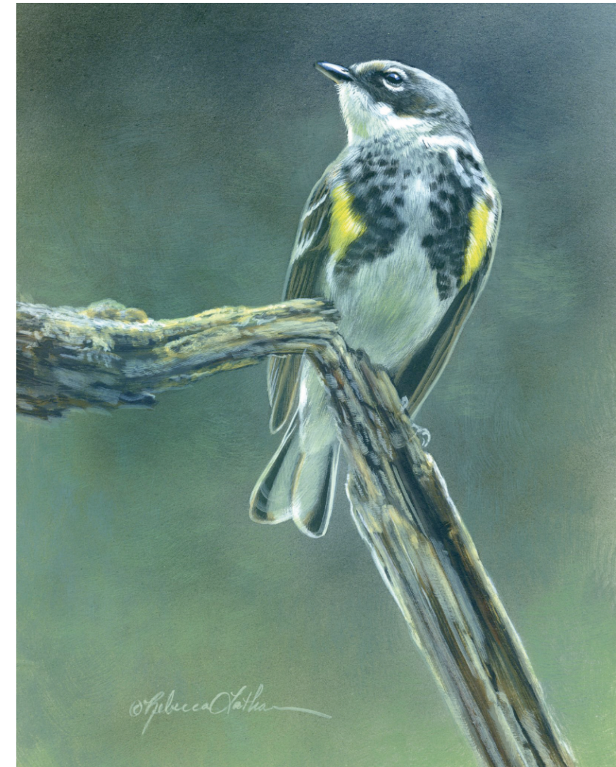
Forest Rimlight - Yellow Rumped Warbler

"Blue Radiance – Black Capped Chickadee" emerged from my fascination with how a simple shaft of winter light can transform a gnarled branch into a stage for quiet drama. Here, the chickadee stands bold against the soft blue sky, its silhouette rimmed in glow that celebrates the bird's resilience without overpowering its delicate form. I used subtle layering to evoke that backlit halo, letting the interplay of shadow and radiance mirror the chickadee's cheerful spirit amid the cold. This piece is my ode to those fleeting winter moments when light pierces the ordinary, revealing the vibrant pulse of life perched on the edge of frost.