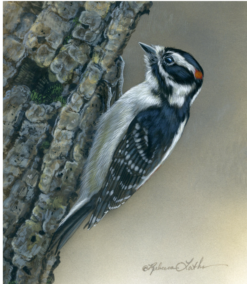
Muted Drummer - Downy Woodpecker

Opaque & Transparent Watercolor on Museum Board