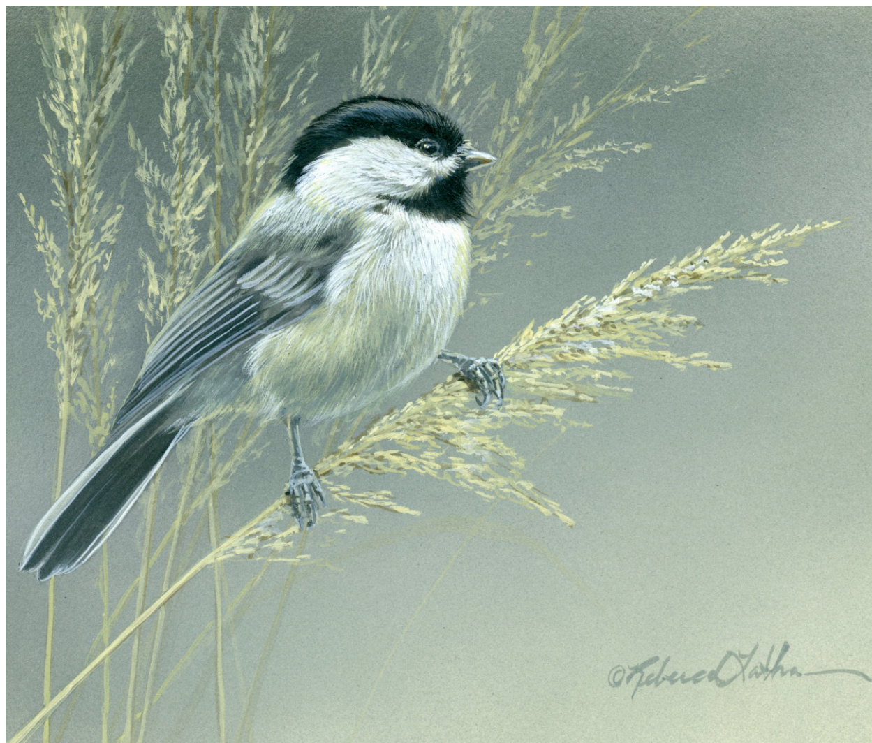
Stillness of Silver Haze - Black Capped Chickadee

Opaque & Transparent Watercolor on Museum Board