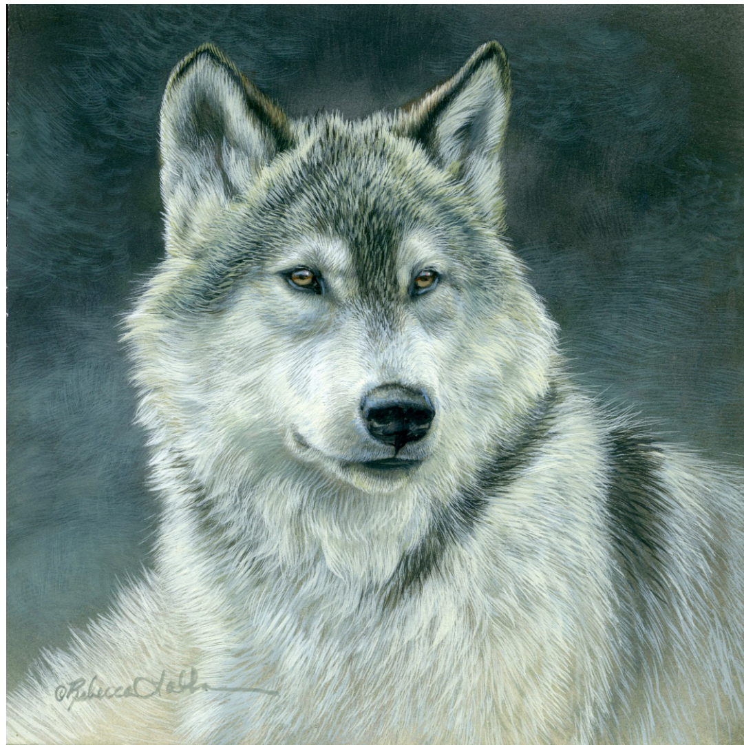
Luminous Stillness - Wolf

Opaque & Transparent Watercolor on Museum Board