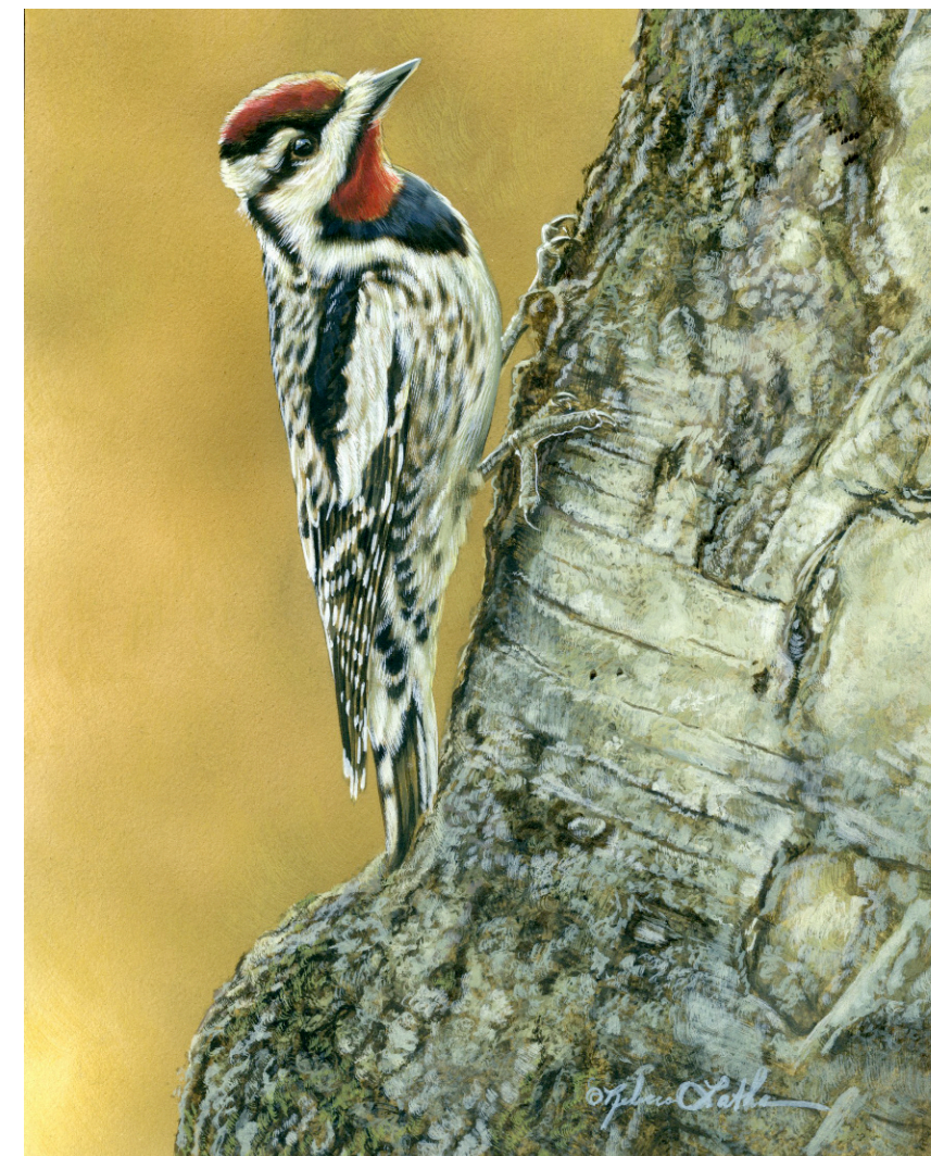
Backlit in Gold - Sapsucker

"Stillness of Silver Haze – Black Capped Chickadee" captures the delicate poise of the bird atop a grass tassel, where soft light filters through a misty grey veil, suspending time in quiet wonder. I layered translucent glazes to evoke that ethereal fog, letting the chickadee's crisp form emerge as a focal point of life amid the diffused haze, its feathers catching subtle gleams like whispers of dawn. The interplay of texture in the grass and the gentle blur of the background mirrors the bird's alert yet tranquil presence in nature's soft embrace. This piece is my reflection on those fleeting, fog-kissed mornings when the world hushes, revealing the intricate grace of even the smallest wanderers.