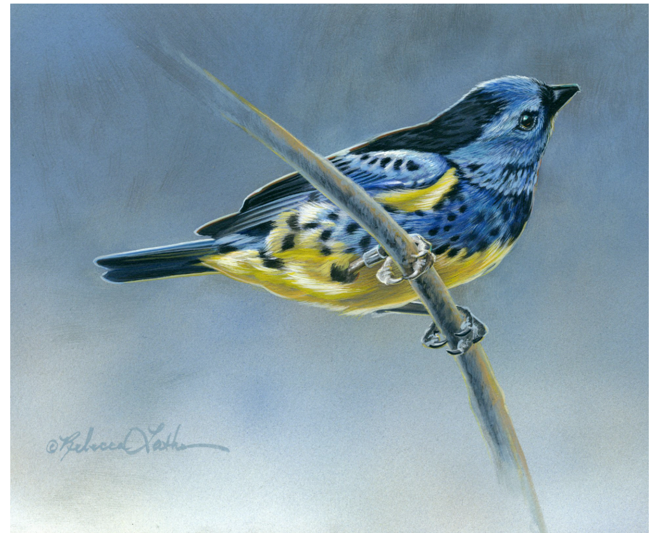
Gentle Perch - Turquoise Tanager

"Snowlight Visitor – Black-capped Chickadee" was born from those hushed winter afternoons when fresh snow softens the world and a lone chickadee brings it back to life. I painted the bird perched on an old branch with light flakes drifting down, using a gentle blue background to wrap the scene in cool serenity while the soft glow catches its tiny form. The falling snow and diffused light mirror the bird's fearless curiosity in the cold, blurring the line between stillness and subtle motion. This piece is my celebration of winter's quiet visitors, those small sparks of warmth that remind us life persists, bright and unyielding, even in the gentlest storm.