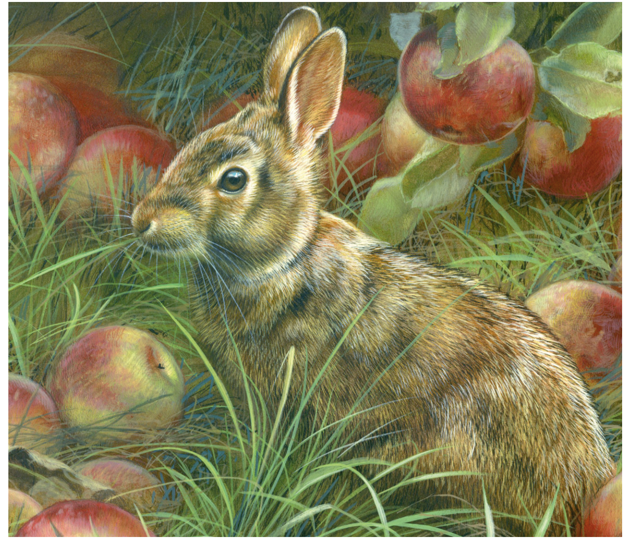
Gentle Forager - Cottontail

"Muted Drummer – Downy Woodpecker" grew out of my love for the quiet, easily overlooked moments in the woods. In this piece, I wanted to step away from the bright, high-contrast drama that woodpeckers often inspire and instead lean into a softer, more introspective mood. The downy's gentle posture and the restrained palette echo the hush between its tapping rhythms, when the forest seems to pause and listen. By subduing the color and focusing on subtle shifts of value and texture, I hoped to invite the viewer closer, to notice the fragile balance of light, feather, and bark. This painting is my tribute to the small, persistent lives that give the forest its heartbeat, even when they barely raise their voices.