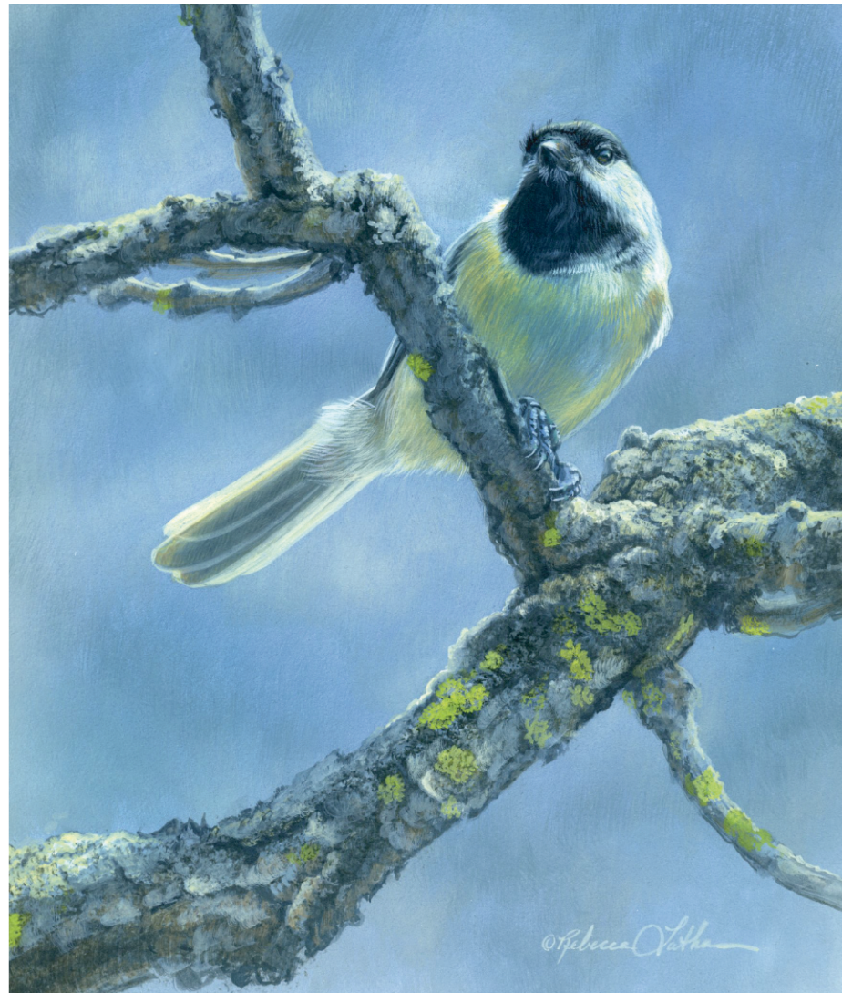
Blue Radiance - Black Capped Chickadee

Opaque & Transparent Watercolor on Museum Board